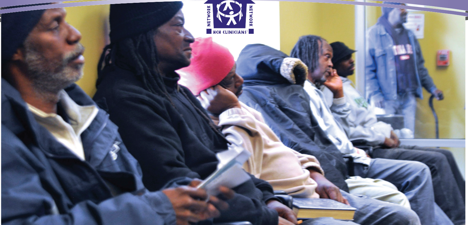
Waiting area on a cold day at the Downtown Clinic in Nashville, Tennessee.