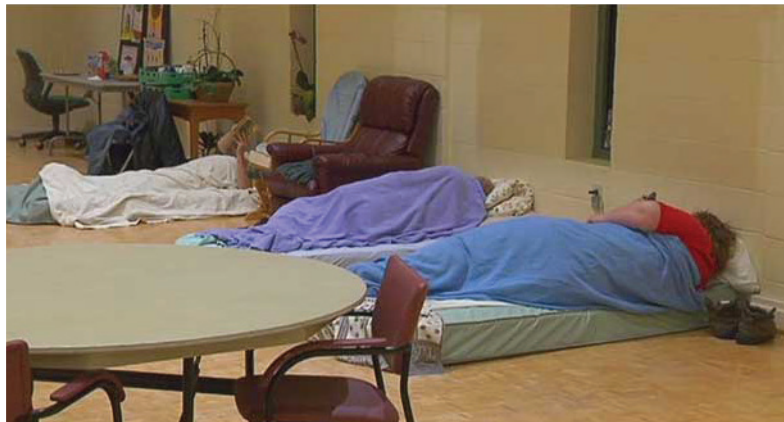
Improvised shelter in a church building in Nashville, Tennessee.