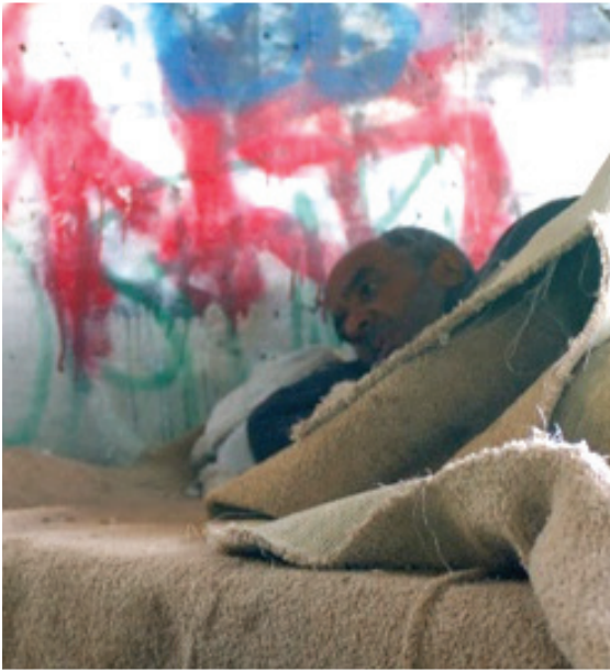
A man fashions a bed under a bridge.

strategies to reduce cigarette consumption could help improve sleep in the short run while reducing smoking-related deaths in the long term.