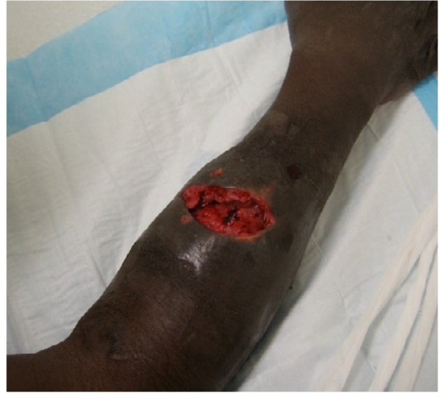
EXAMPLE OF CHRONIC ABSCESS (PHOTO COURTESY OF DR. SUSAN PARTOVI)

Medical respite programs can greatly impact the clinical outcomes for patients with wounds. Wounds are difficult to properly care for when patients are on the streets or in emergency shelters where adequate hygiene is challenging, wound supplies limited, and infection control practices inadequate. Many foot wounds require limited weight bearing in order to heal, and this is more difficult to abide by for patients without homes. Inadequate wound care can lead to chronic non-healing wounds and wound complications such as osteomyelitis and amputations. Respite offers the opportunity for complete healing of wounds so as to avoid these complications and can offer patients education about prevention of future wounds. Many wounds determined to be chronic are non-healing wounds due to inadequate care. Often these seemingly chronic wounds can be healed with appropriate medical attention that can be provided in respite.