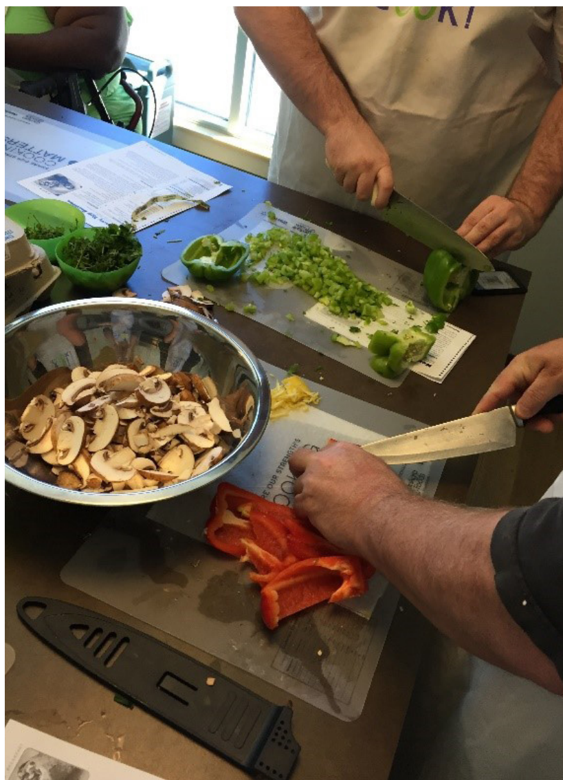
PARTICIPANTS IN A "COOKING MATTERS" CLASS PREPARE HEALTHY VEGETABLES

Service providers face a lot of pressure to meet reporting measures in order to maintain organizational stability and regular funding. In some cases, clinics may be measured and evaluated based on the implementation of indicators that are not actually the most relevant for the populations they serve and may not account for the complicated circumstances in which patients without homes live. Some care providers have come up with novel ways to meet requirements by combining screenings or developing creative ways to weave together interventions,