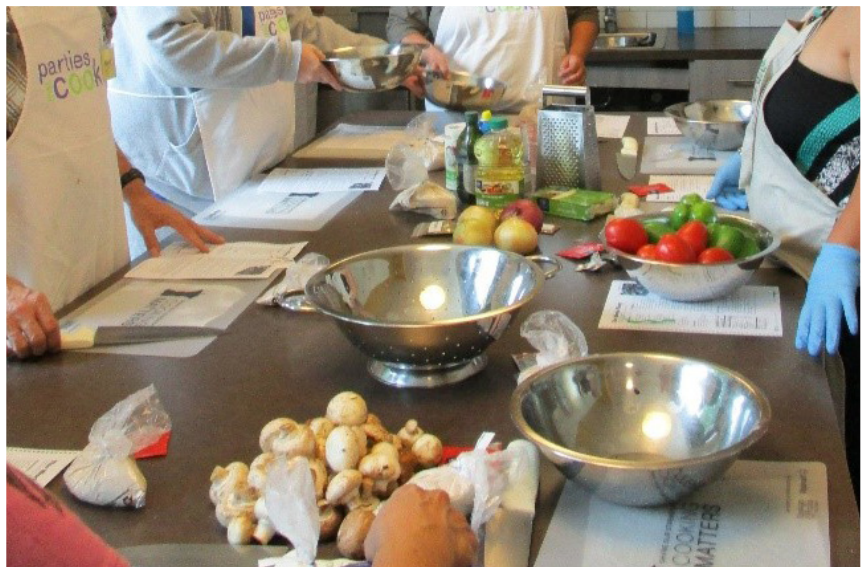
A “COOKING MATTERS” CLASS AT CENTRAL CITY CONCERN’S OLD TOWN CLINIC IN PORTLAND, OREGON

Our offerings include acupuncture, art therapy, positive thinking, healthy cooking, and a wellness calendar. Every day of the week there are several activities available that provide comprehensive spirituality, healing, qi gong, yoga, and clay and ceramics. We also have a new collaboration with Oregon Food Bank: Cooking Matters, a 6-week cooking program for clients who may not know how to cook or know what is in season; they get... a better understanding of nutrition and cooking on a budget... I would consider these programs preventive care. Most people just think of medical visits and checkups and things like that, but primary care is also about engaging people