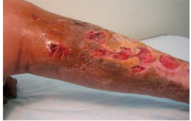
EXAMPLE OF CHRONIC ABSCESS