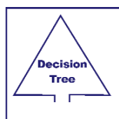
Figure 1.1 Decision Tree How to Address Suicidal Thoughts and Behaviors in Substance Abuse Treatment