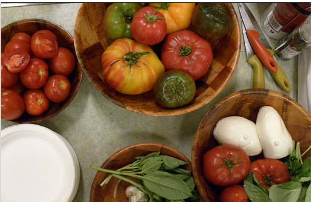
Food prep for a cooking class at the 140 Mason Street project, which consists of 56 studio apartments designed for homeless and disabled single adults in San Francisco