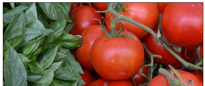
Riverdog Farm Produce, Berkeley Farmer's Market