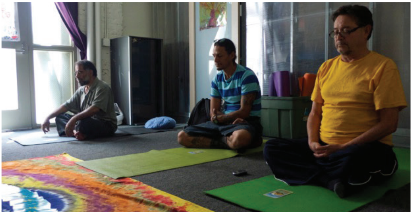
Homeless Health Care Los Angeles offers additional holistic services like tai chi and mindful meditation alongside harm reduction strategies.

Therapists conceptualize decision making as being a 'balance sheet' of comparative potential gains and losses (Cancer