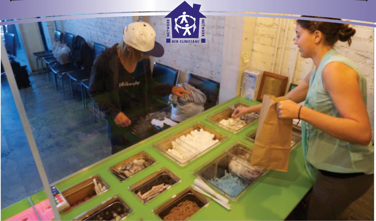
Clients access safe, clean injection supplies at the Center for Harm Reduction in Los Angeles, California.