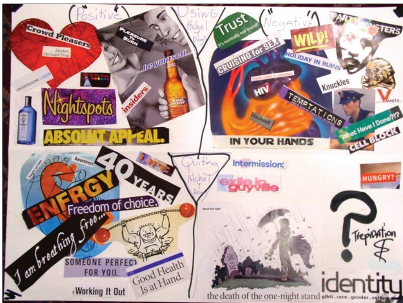
Decisional balance sheet represented by collage. Image courtesy of Valery Shuman, ATR-BC, LCPC, and used with permission of the artist.

New Mexico has the highest rate of heroin and prescription drug overdose deaths in the nation, and teen heroin use in New