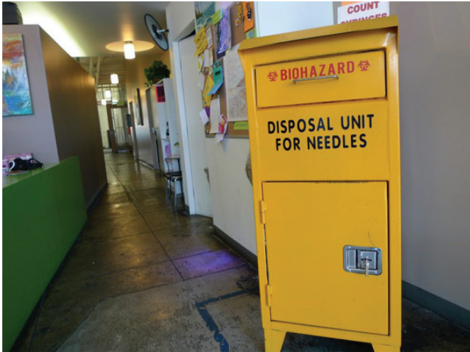
Needle disposal unit at the Center for Harm Reduction in Los Angeles.

We keep our clients safe by distributing clean injection supplies, providing disease management, and offering education that focuses on overdose prevention/reversal with naloxone and safer injecting techniques.