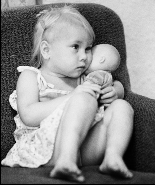
Homelessness is devastating for children.