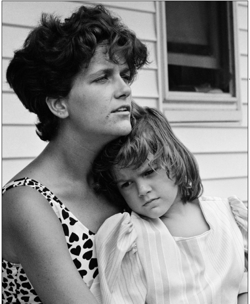
Many homeless mothers experience anger, self-blame, sadness, fear & hopelessness (The National Center, 2011).

Of the almost 700,000 people receiving HPRP assistance in the program's first year, 44 percent were children (HUD, 2011).